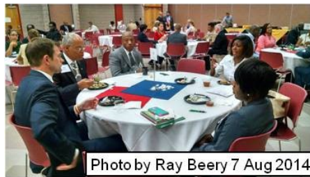
7 Aug 2014

The OLLI-Mason Board of Directors voted in July to donate $1000 from the Friends of OLLI charitable fund to sponsor George Mason University's first annual Veterans' Employment Summit, held on campus August 7. The summit, planned jointly by Mason's Office of Military Services (OMS) and the Easter Seals Veteran Staffing Network, was designed to help local veterans gain access to meaningful employment opportunities in Northern Virginia and beyond.