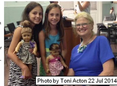
22 Jul 2014