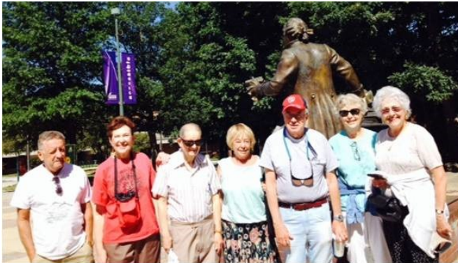
OLLI Walking Group Near Statue of George Mason, Aug 18, 2014

Website What's New Catalog DocStore Facebook Officials Member Portal Contact Us