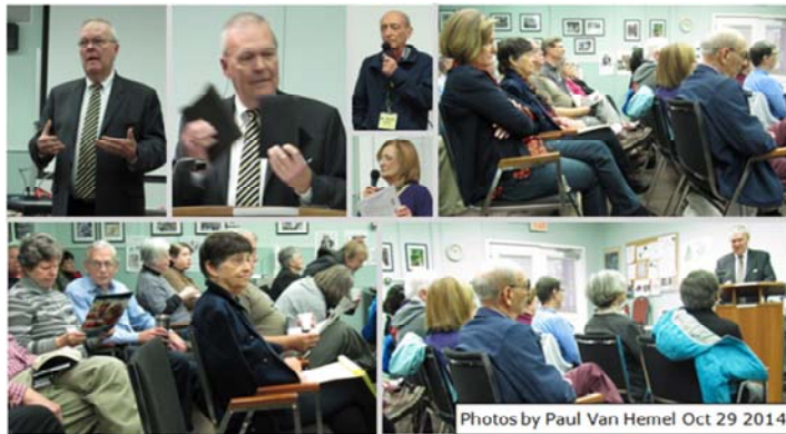
Oct 29 2014

Website What's New Catalog DocStore Facebook Officials Member Portal Contact Us