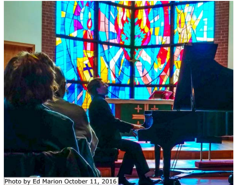
October 11, 2016