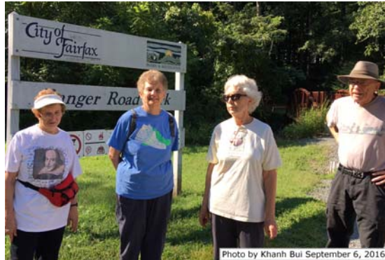
September 6, 2016

Website What's New Catalog DocStore Facebook Officials Member Portal Contact Us