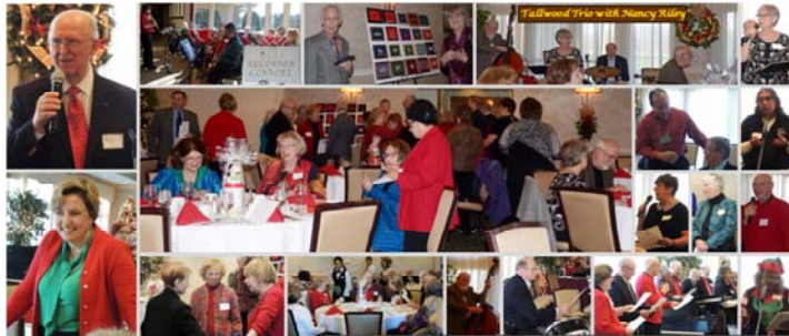
December 2, 2016

Website What's New Catalog DocStore Facebook Officials Member Portal Contact Us