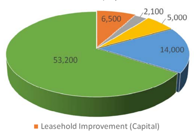
Facilities - $80,800

This figure shows a breakout of facilities expenses projected for this year.