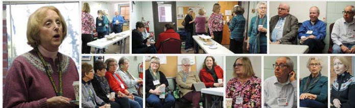
January 25, 2018

Website What's New Catalog DocStore Facebook Officials Member Portal Contact Us Loudoun Newsletter