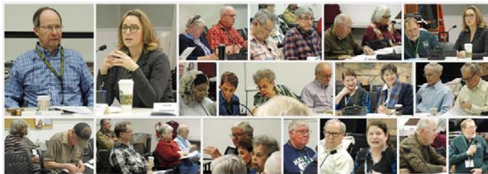
March 15, 2019

Website What's New Catalog DocStore Facebook Officials Member Portal Contact Us Loudoun Newsletter