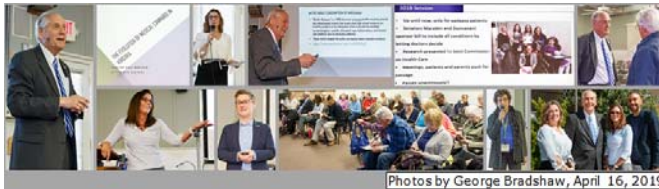
April 16, 2019

Website What's New Catalog DocStore Facebook Officials Member Portal Contact Us Loudoun Newsletter