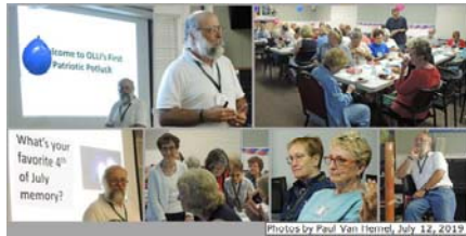
July 12, 2019 Patriotic Potluck, Tallwood, July 12

Website What's New Catalog DocStore Facebook Officials Member Portal Contact Us Loudoun Newsletter