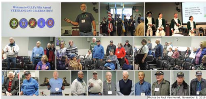
OLLI 5th Annual Veterans Day Celebration, Tallwood, November 8 (see article below)

Website What's New Catalog DocStore Facebook Officials Member Portal Contact Us Loudoun Newsletter