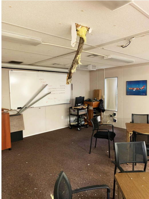
Limb Damage to TA-2 Classroom at Tallwood, September 12 (No Harm to Personnel or Equipment); It Is Under Repair by Mason Facilities

Website Quick Links Catalog DocStore Facebook Officials Member Portal Contact Us Loudoun Newsletter