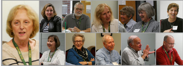
October 14, 2022

Website Quick Links Catalog DocStores Facebook Officials Member Portal Contact Us