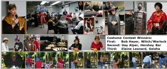
October 21, 2022

Website Quick Links Catalog DocStore Facebook Officials Member Portal Contact Us