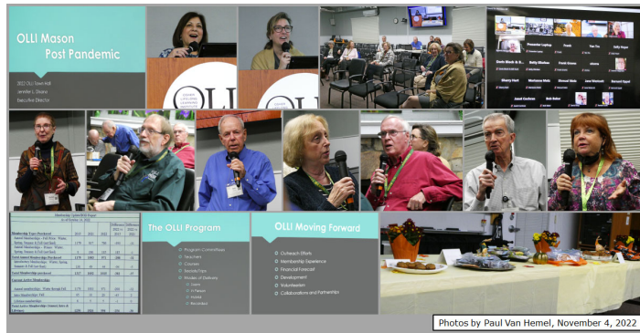
OLLI Town Hall Meeting, November 4

Website Quick Links Catalog DocStore Facebook Officials Member Portal Contact Us