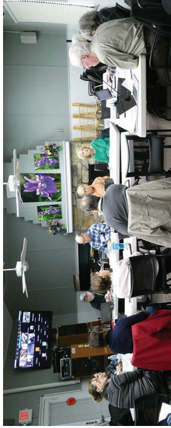
January 20, 2023

The OLLI Board of Directors met at Tallwood on January 20. Some of the key topics discussed were: