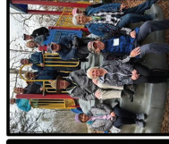
January 3