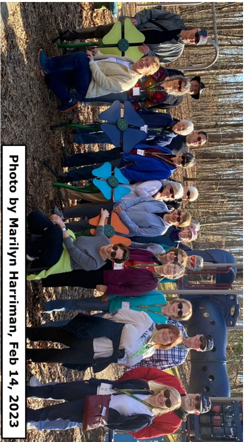
Feb 14, 2023

As the weather turns warmer, the club is planning several one-hour outings in March: