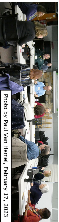
February 17, 2023