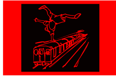
Into the Heights

immigrants living in New York City's Washington Heights area, through the eyes of the local bistro owner. It's the prequel to Westside Story. Group-rate tickets are $44 per person. Optional après-show dinner at a nearby restaurant. To sign up for the show and dinner, please email Norma at njreck@cs.com .