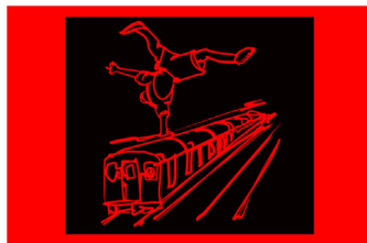
In the Heights

On Saturday, June 10, TLG members are headed to NextStop Theater in Herndon, VA, to see the 2:00 matinee of Lin-Manuel Miranda's In the Heights . Tickets are $44 per person, OLLI group rate. We will go to A Taste of the World restaurant, right around the corner from NextStop, for an optional dinner. To purchase tickets, go online to nextstop.com or phone 703-481-5930. Be sure to tell them you are with OLLI to get the discount.