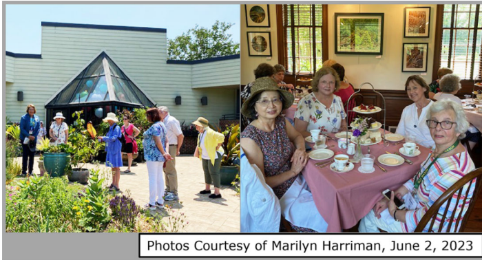
Green Spring Garden Tour and Tea, June 2

Website Catalog DocStore Facebook Officials Member Portal Contact Us