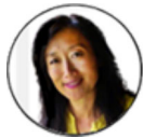
By Shannon Morrow, Program Associate

We all know there are many ways to facilitate successful aging. One way is keeping our brains healthy, and new research indicates that a key to protecting the brain and maintaining cognition is to volunteer. Please read the following articles and consider volunteering at OLLI.