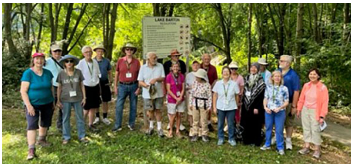
A Walk Around Lake Barton by the Popular OLLI Walk & Talk Club, August 17 ; See Article Below

Website Catalog DocStore Facebook Officials Member Portal Contact Us