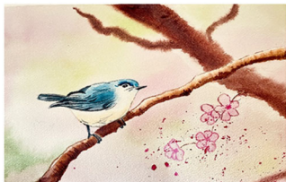
Bluebird and Cherry Blossoms by Yen Tra

Below are two paintings from the spring class participants.