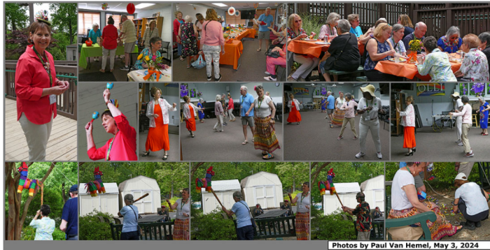
May 3, 2024

Website Catalog DocStore Facebook Officials Member Portal Contact Us