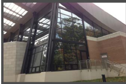
Reston – United Christian Parish Church 11508 North Shore Drive, Reston, VA 20190